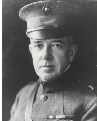
John Henry Russell, Jr.

General John Henry Russell, Jr. was born on November 14, 1872, the son of Rear Admiral John Henry Russell (1827–1897). He was appointed to the United States Naval Academy in May 1888 and graduated from the Academy in June 1892 and after two years at sea. He transferred to the Marine Corps as a second lieutenant on July 1, 1894. 1896, he served in the North Atlantic Squadron until after the Spanish–American War. He next performed duty on Guam then was placed in charge of the School of Application for Officers at the Marine Barracks, Washington, D.C. Following this tour of duty, he was ordered to command the Marine Detachment, USS Oregon, from September 1902 to March 1904. In September 1908, he joined the Naval War College, Newport, Rhode Island, as a member of the staff of that college until 1910.