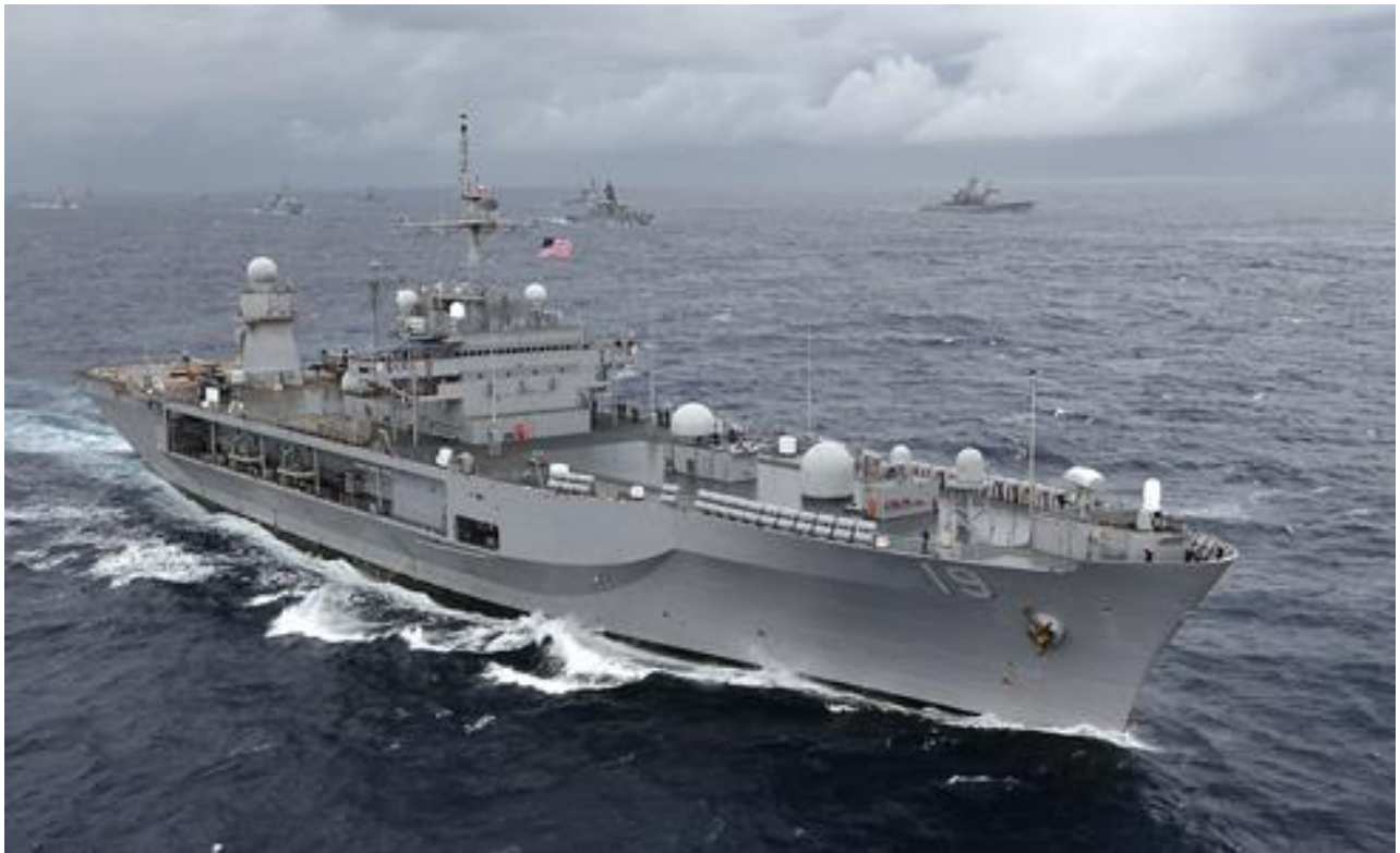
USS BLUE RIDGE (LCC 19)