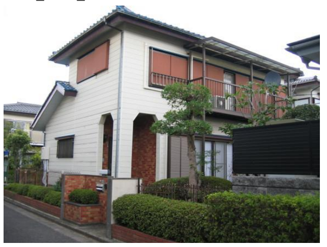
--Example of an off-base house in Mabori Kaigan

Whether you and your family choose to live on base or off base, both offer different opportunities and both are enjoyable living experiences. There are many people in your department who can answer questions you may have about either living arrangement. Just call someone on the list of contacts! For an explanation about dealing with rental agents, up-front costs, and many other details, see